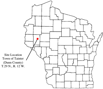
State of Wisconsin